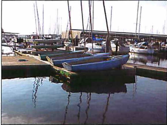
1640 sf float only (A)