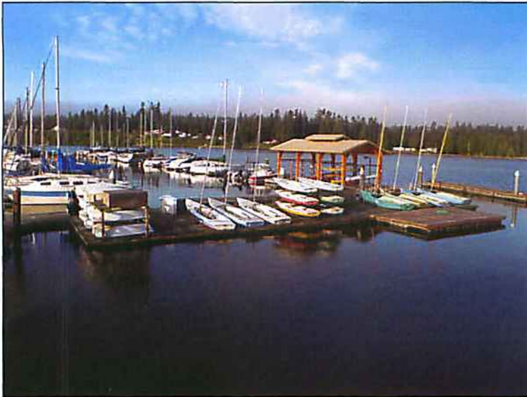
Overall View (A and B)